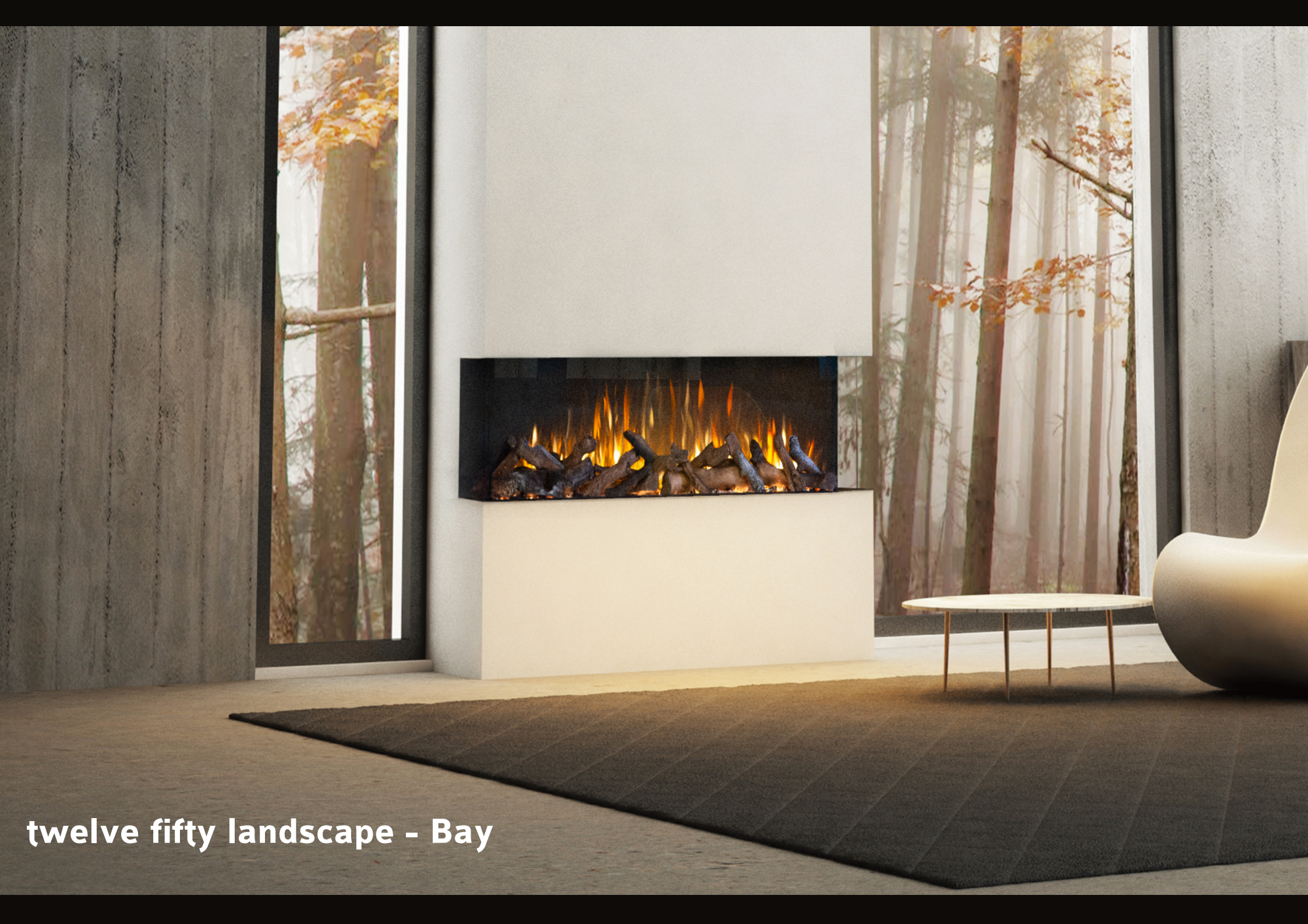
twelve fifty landscape - Bay