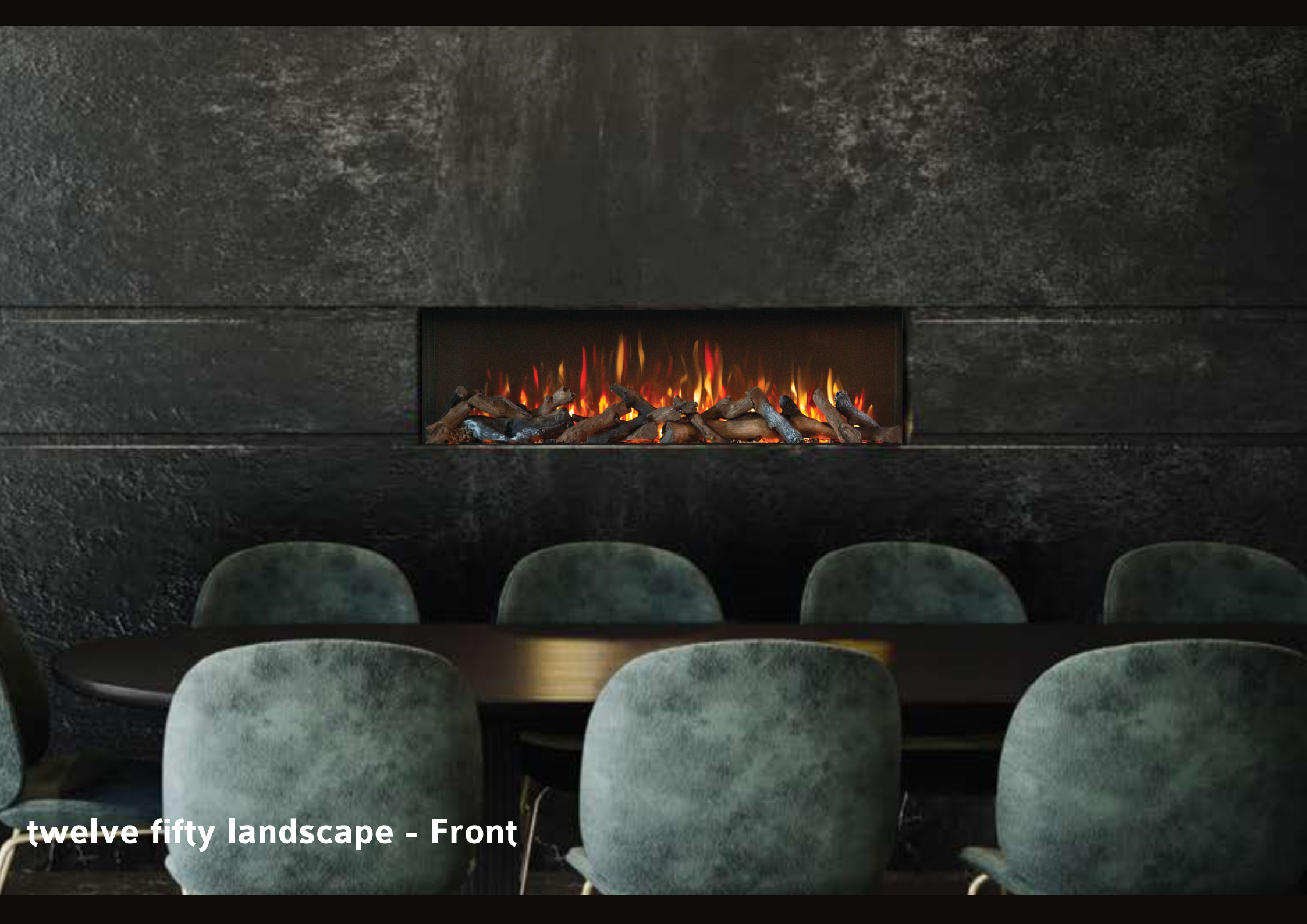
twelve fifty landscape - Front